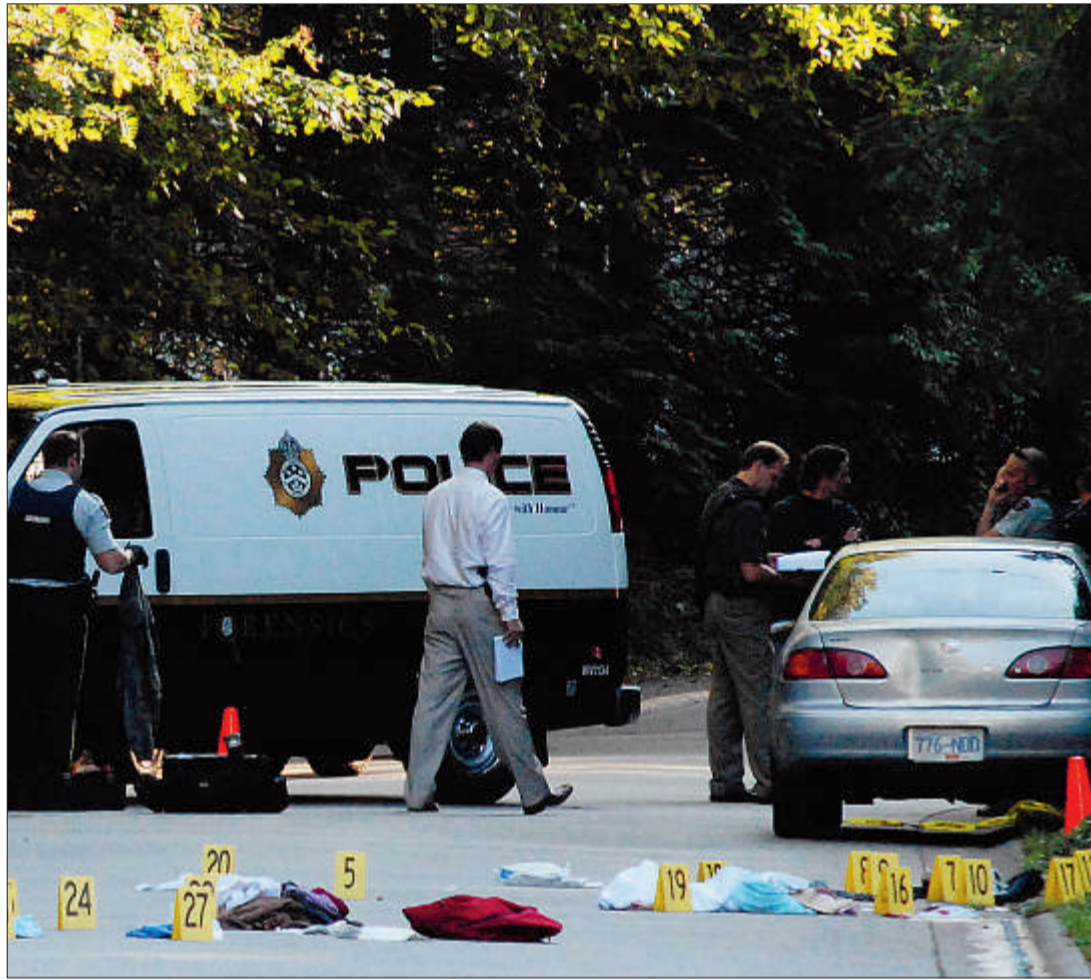
Police investigate a shooting scene in West Vancouver where two men were shot by assailants inside a passing car on a quiet street.

Pair expected to survive daytime attack; police launch massive manhunt for shooters