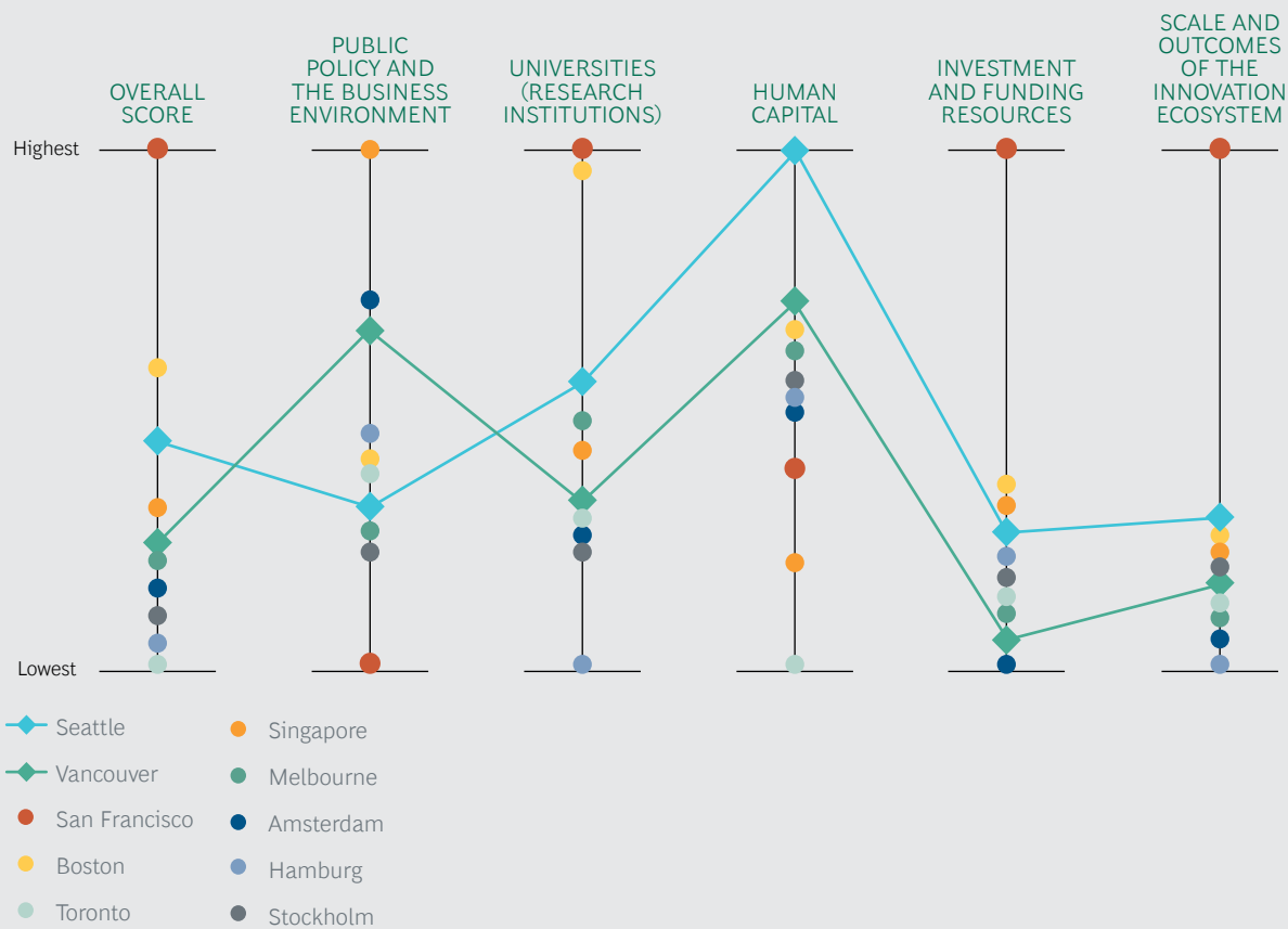
EXHIBIT 1 | The BCG Innovation Index Shows How Seattle and Vancouver Stack Up